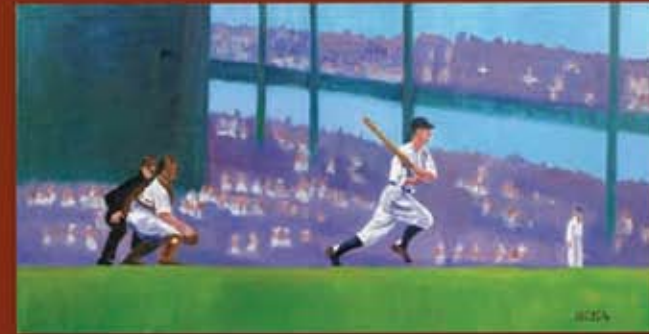
THE IRON MAN LOU GEHRIG, from an undated antique photo