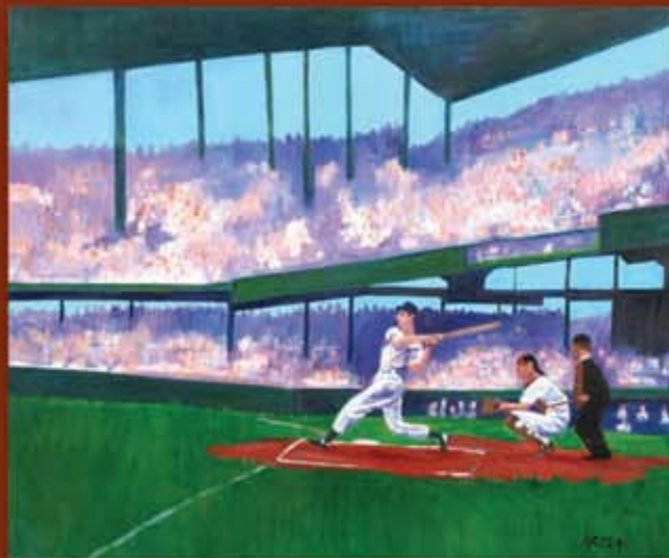
JOLTIN' JOE Joe DiMaggio, June 29, 1941