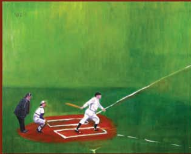
THE BABE BABE RUTH, October 1, 1932

THIS EXCLUSIVE SUITE OF 5 PRINTS IS ELEGANTLY CREATED ON ARCHIVAL WATERCOLOR PAPER. THIS UNIQUE COLLECTION IS LIMITED TO 700 SUITES. EACH PRINT IS SIGNED AND NUMBERED BY THE ARTIST.