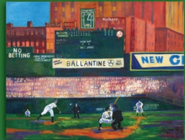
THE PERFECT GAME DON LARSEN, October 8, 1956 at Yankee Stadium

MICKEY MANTLE, September 16, 1951 - Yankee outfielder Mickey Mantle, the first man to face Bob Feller in the first inning. Yankees outscored the Cleveland Indians 6-1, putting themselves back in first place in the American League 26" X 34"